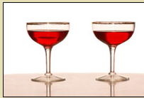
Zune 1124 Manual 1